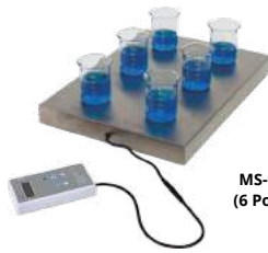
MS-06BSUA (6 Positions)