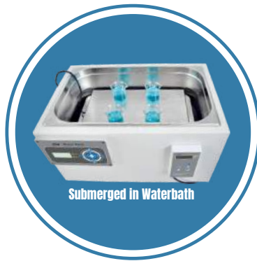
Submerged in Waterbath