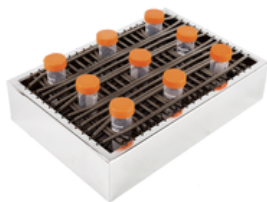
Mini Universal Spring Platform