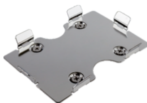
96-Well Micro-Plate Holder