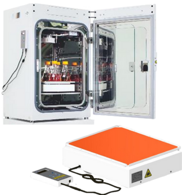
Orbital Shaker – CO2 Resistant (OSC-26M)

Developed to help you economically scale-up cell production in your existing CO2 Incubator. Designed with sealed electronics to minimize heat disruption and ensure that conditions in the CO2 chamber are not affected.