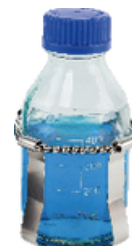
Infusion Bottle Clamp