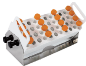
Adjustable Tube Rack