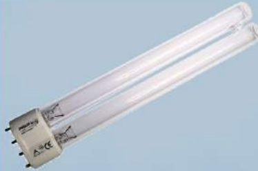
UVC Replacement Bulb Crystal Product #: CR-L-18