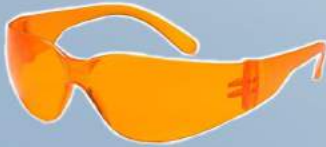
UVC Safety Glasses Crystal Product #: CR-G-18