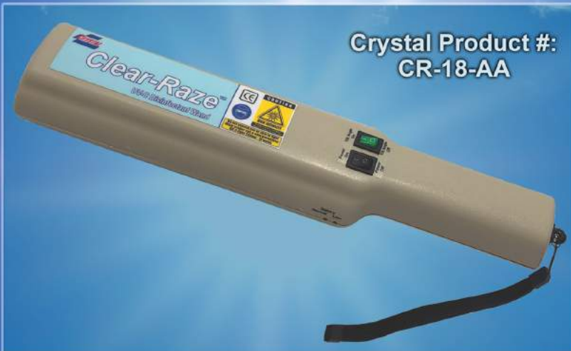
Crystal Product #: CR-18-AA

The Clear-Raze series of Handheld UVC wands provide UV radiation with a wavelength of 254nm.