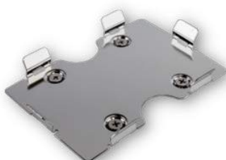
96-Well Microplate Holder