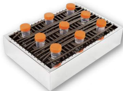
Mini Universal Spring Platform