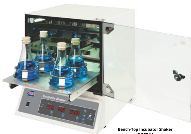
Bench-Top Incubator Shaker IS-RSDAA

Compact Size shaker with advanced features, a sliding platform, and great visibility through a tempered glass door.