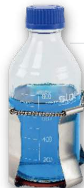
Infusion Bottle Clamp