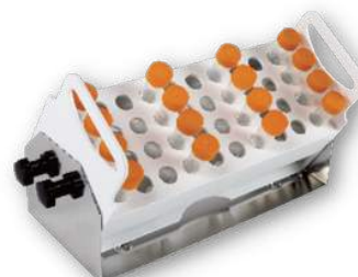
Adjustable Test Tube Rack